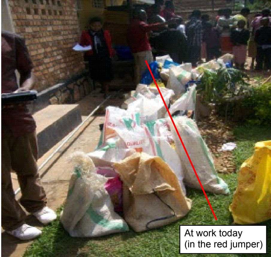
At work today (in the red jumper)